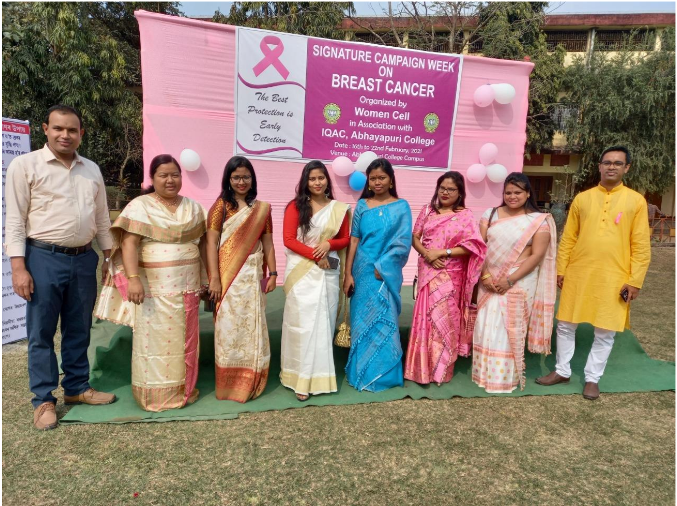
Signature Campaign Week on Breast Cancer, held on 16 – 22 February, 2021, organized by Women Cell, Abhayapuri College