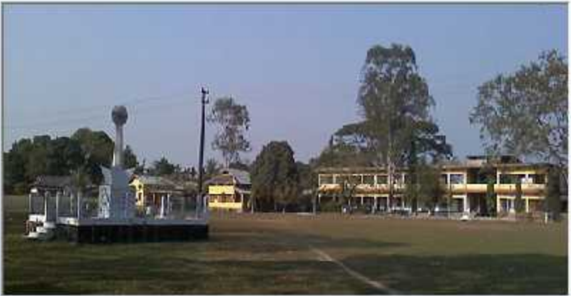
Developed by - Utron Computers, Howly Copyright (c) 2016- Utron