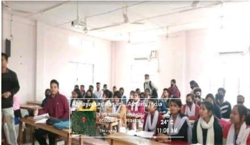
Participants of Front Office Executive Date- 11 NOV 2021